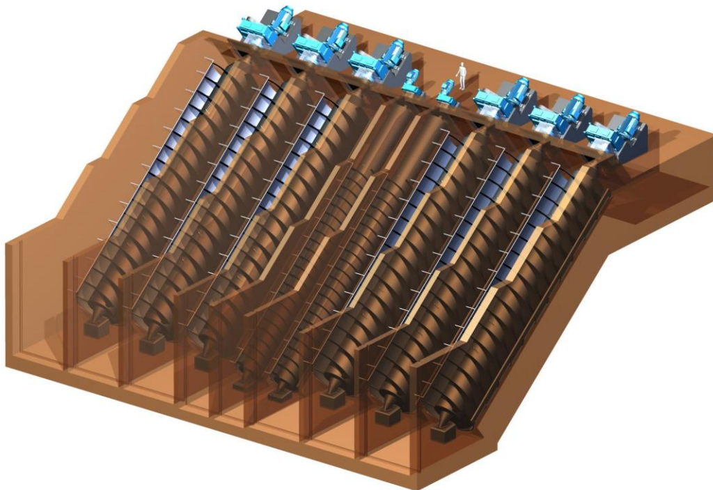
A 3D impression of the workings of the pumping station

The prestigious project has been awarded to Spaans by Black & Veatch who are the principle contractor for a major refurbishment of Yorkshire Water's Bransholme surface water pumping station.