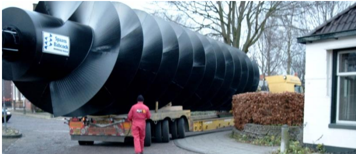
A similar sized unit leaving Spaans factory for a pumping station in Paris

Archimedes screws are ideal for this application as the large flights and clearances allow the screws to handle the debris often found in storm water without blocking. The other significant advantage is that the pumps can be run dry, this means they can be tested periodically without flow to give confidence that when they are required to run in anger they will do so. Spaans are installing monitoring systems which will analyse the equipment under both loaded and no-load conditions.